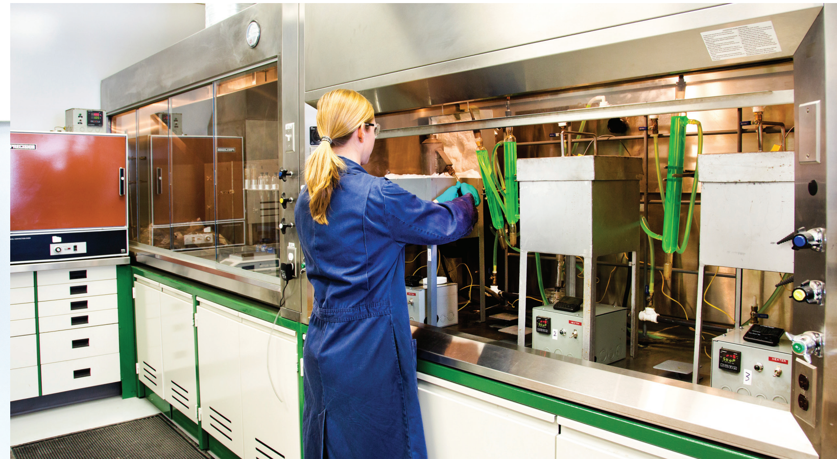
Modified Fischer Assay Testing