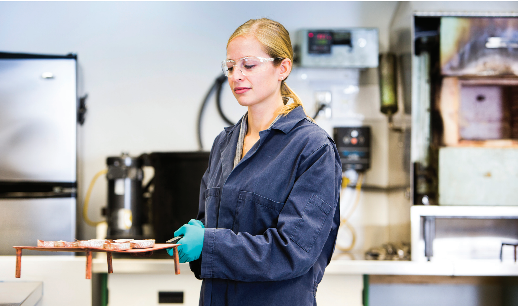
Feed Sample Preparation

Our in house lab capabilities are augmented as needed by the services of third party labs. UMATAC manages all third party engagement.