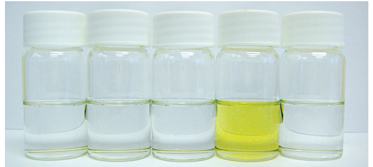
Hydrotreated Product Oils

Our team has the experience to provide comprehensive feasibility studies including: cost estimates, preliminary engineering designs, mass and energy balances, process flow diagrams, and process instrumentation diagrams. We also supply detailed engineering field technical services such as construction, commissioning and start-up technical assistance to the owners.